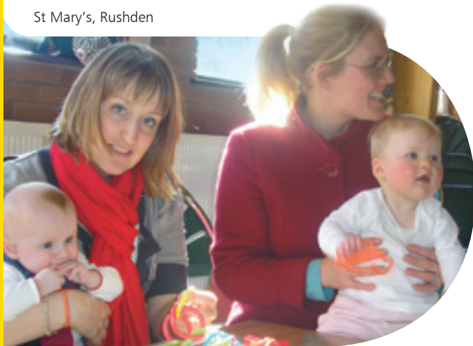
St Mary's, Rushden

Pray for the Growing Leaders – Training the Trainers event in Ripon today.