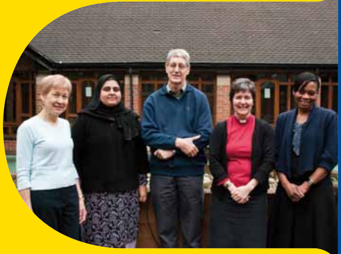
Lay and ordained leaders at St Paul and St Stephen's, Nottingham (a CPAS patronage church).

Pray for all the lay and ordained leaders who are mentored by a member of CPAS staff.