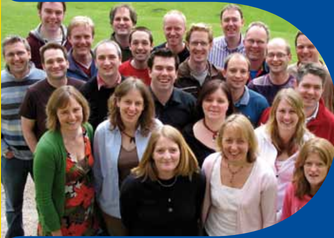
Arrow 9 participants

May I never boast except in the cross of our Lord Jesus Christ, through which the world has been crucified to me, and I to the world. Galatians 6:14