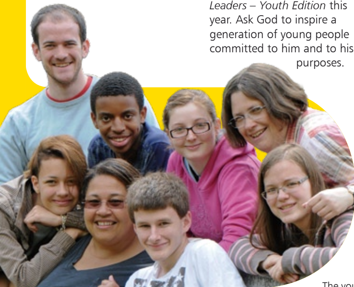
The youth group at St John's, Stanmore

Ask God to help children and young people stand firm in their faith at school, and share Jesus' love with their friends and families.