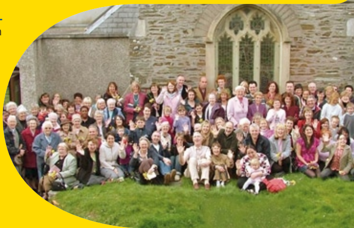
St Pancras, Pennycross

Pray for parish representatives and PCCs who are compiling parish profiles. These are a crucial part of the appointment process and help candidates discern their future ministry.