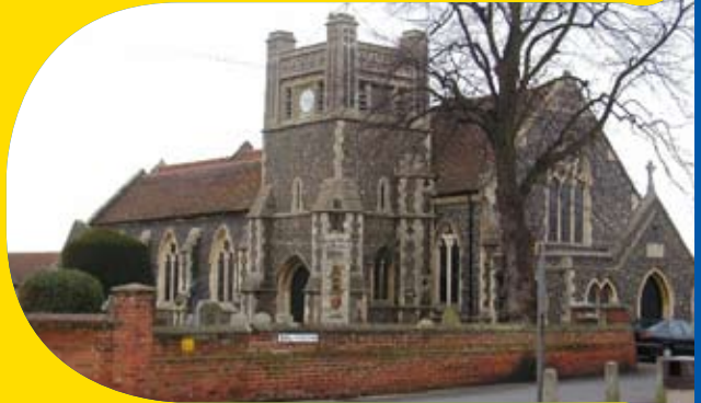
St Mary's Church, Walton, Orwell Team