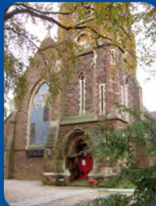
St Jude's, Wolverhampton

There are about 100 names on the register of evangelical clergy looking for a move that is administered by CPAS patronage. Please pray for all those clergy as they think and pray for guidance about the future.