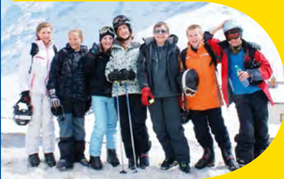
Members on last year's Ski Venture.

May the God of hope fill you with all joy and peace as you trust in him, so that you may overflow with hope by the power of the Holy Spirit. Romans 15:13