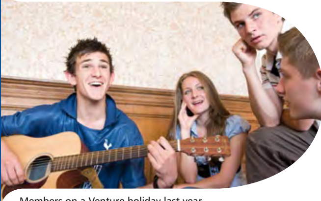
Members on a Venture holiday last year.

This is the message we have heard from him and declare to you: God is light; in him there is no darkness at all. 1 John 1:5