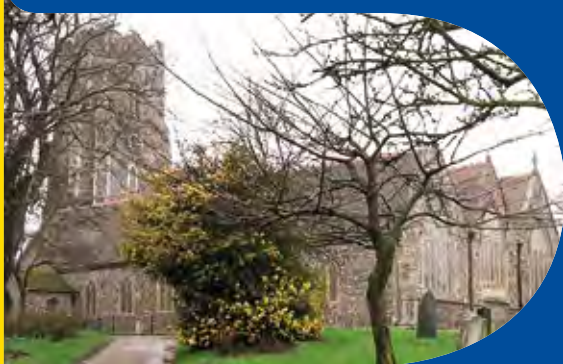
Christ Church, Nailsea.

As CPAS holds a You and Ministry event in Wales, pray for those attending to gain a clearer understanding of God's call on their lives.