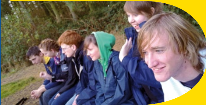
Teenagers on a Growing Leaders – Youth Edition course

How great is the love that the father lavished on us, that we should be called children of God! 1 John 3:1