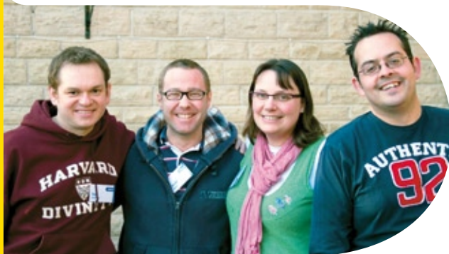
Participants on Arrow 11

My prayer is not for them alone. I pray also for those who will believe in me through their message, that all of them may be one, Father, just as you are in me and I am in you. John 17:20-21