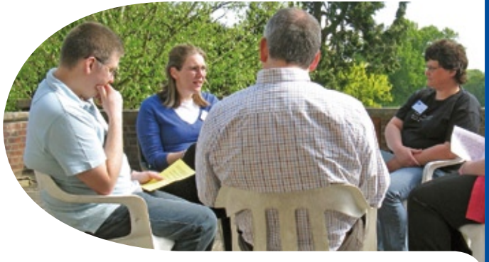
Taking part in a You & Ministry weekend

You & Ministry continues today, with opportunities for the delegates to seek wise counsel from the leaders and space alone with God. Pray that each individual finds the right balance.