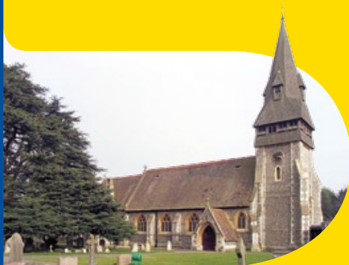
Christ Church, Chorleywood

As I was with Moses, so I will be with you; I will never leave you nor forsake you. Joshua 1:5