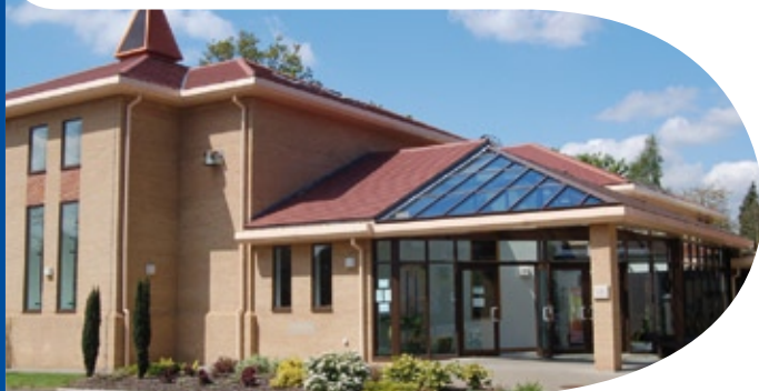
St Luke's, Watford, a CPAS patronage church

Now you are the body of Christ, and each one of you is a part of it. 1 Corinthians 12:27