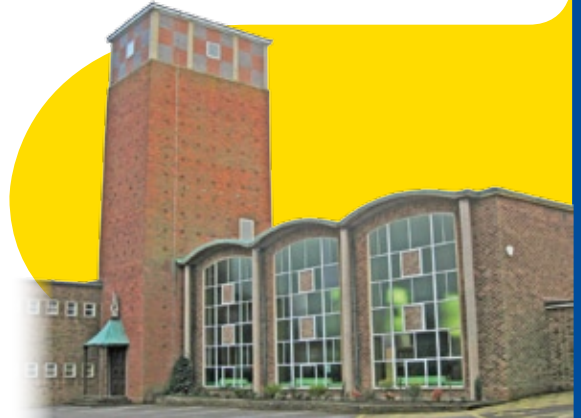
Christ Church, Cheylesmore

As England's largest evangelical patron, CPAS has a key role to play in appointing clergy who have a heart for sharing the gospel and seeing people won for Christ.