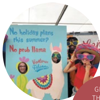
Ventures and Falcons at Big Church Day Out