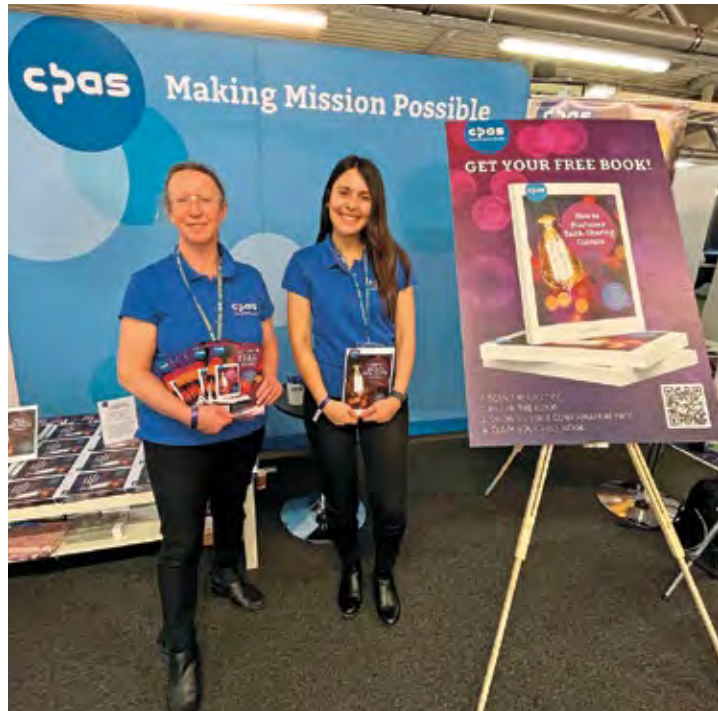
Launched at the 2022 New Wine National Leadership Conference and an online live event

CPAS has just launched a new resource offering 77 creative ideas to help church leaders shape the culture of their churches to be more evangelistic.