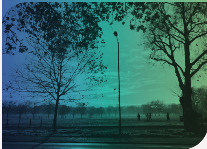
PECKHAM RYE COMMON

“Peckham Rye provides a pleasant refuge for the local community.”