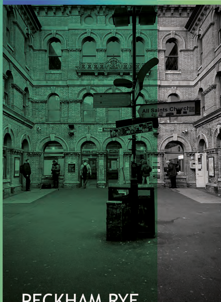
PECKHAM RYE STATION

Peckham, part of the London Borough of Southwark, is located south of the River Thames, about 3 miles from Westminster and central London.