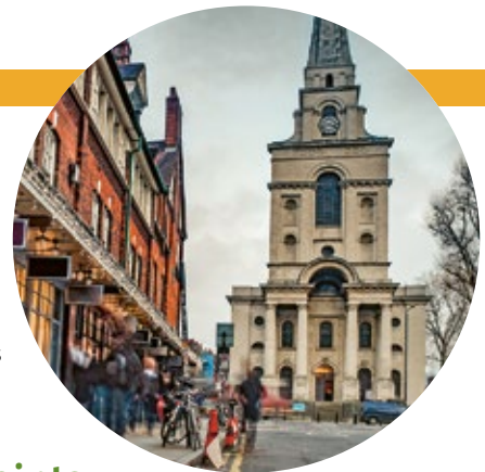
Christ Church Spitalfields