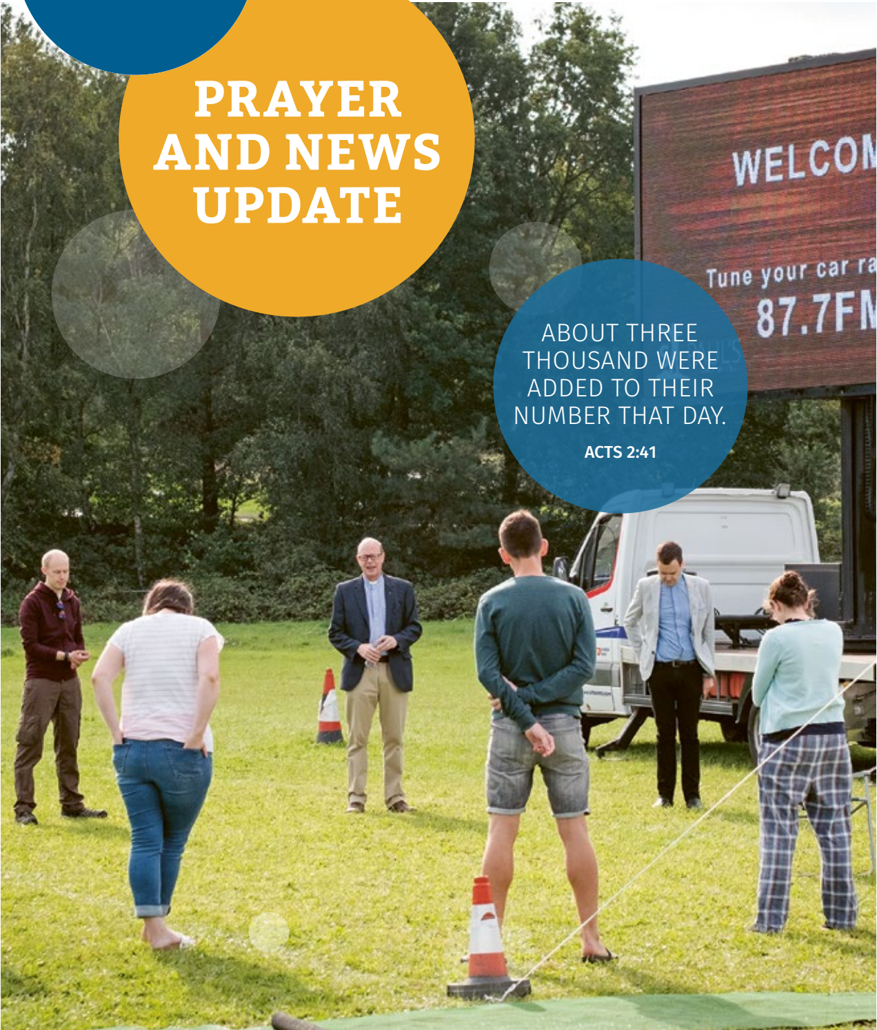
A COVID-safe drive-in church service at St Paul's Leamington Spa, a CPAS patronage church.

LATEST UPDATE: SUPPORTING THE MINISTRIES OF CPAS